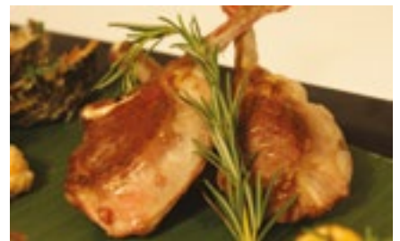
Marinated Lamb Cutlets

English style beef wellingtons, served with a yearling roast beef