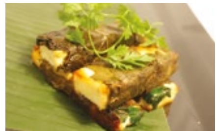
Grilled vine leaf haloumi

Pickeled vine leaves, grilled and wrapped around haloumi cheese