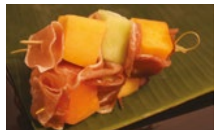
Prosciutto and Melon

Served on a skewer, a glorious mixture of prosciutto with fresh cantaloupe balls