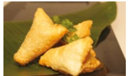
Pumpkin and Almond Samosa

Turkish style falafel balls with a tzatziki dip atop with onion & tomato