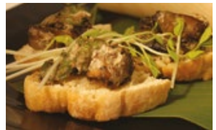
Feta, Rocket and Mushroom Bruschetta