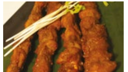
Satay Chicken Skewers

Garlic and herb marinated cutlets, fresh from the grill! served in a Greek style with Tzatziki dip