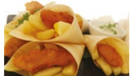
Whiting fillets and Chips

Individual cones of chunky steakhouse wedges served with a tangy sour cream