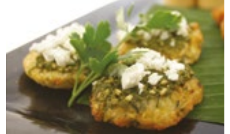
Gourmet Potato Rosti Fritters

Sweet potato & the texture of the cashews with a Mexican spice