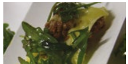
Mini Gnocchi Bolognese

A sensational mix of original fish & chips - 1pc whiting fillet and individual chips, served with fresh Tartar sauce and lemon wedges