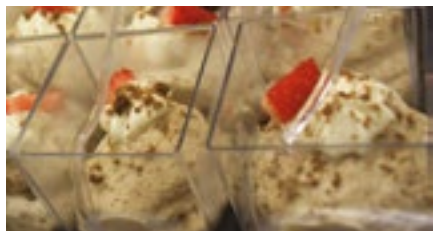
Chocolate Ripple Cake