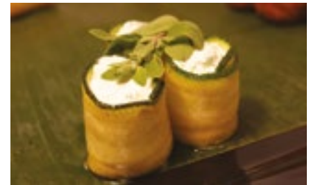
Rolled citrus goats cheese filled zucchini

Thin strips of zucchini, grilled and rolled around a zesty citrus goats cheese