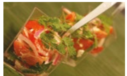
Tomato and Feta Salad Cups