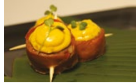
Peppered Beef Mignon

Scotch fillet steak wrapped in bacon and served on a toothpick with a peppered Béarnaise sauce