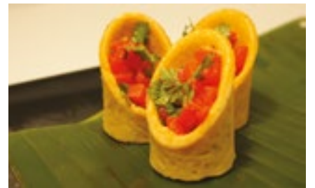
Fire Roasted Red Pepper Tartlets

Topped with goats cheese, olives, and basil pesto