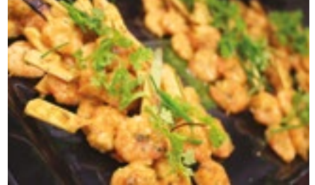
Grilled and Glazed Prawn Skewers

Market fresh prawns, placed on skewers and served with a honey soy glaze