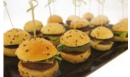
Mini wagyu beef burger

Bite sized beef burger, with lettuce, cheddar, onion jam relish served on a small finger food size bun!