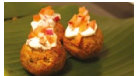
Falafel topped with Onion, Tomato & Tzatziki

Italian risotto Aranchini balls with cheese, Sundried tomato, basil pesto and bacon