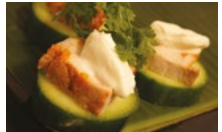
Tandoori Chicken Bites

A round of cucumber sliced thickly, topped with a dollop of mint yogurt and pieces of moist tandoori chicken atop