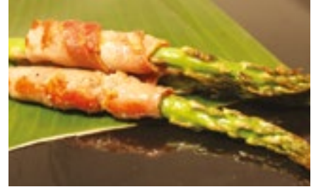
Asparagus Spear Parcels in Prosciutto

Fresh asparagus spears, wrapped in a tasty prosciutto, drizzled with a light olive oil