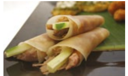
Peking Duck Pancakes

Authentic Peking duck recipe with a Hoi sin sauce, cucumber and other Asian vegetables wrapped in a pastry pancake