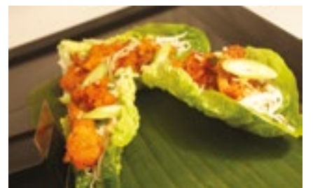
Chilli Blue Swimmer Crab

Chilli blue swimmer crab with rice noodles, served in a lettuce cup